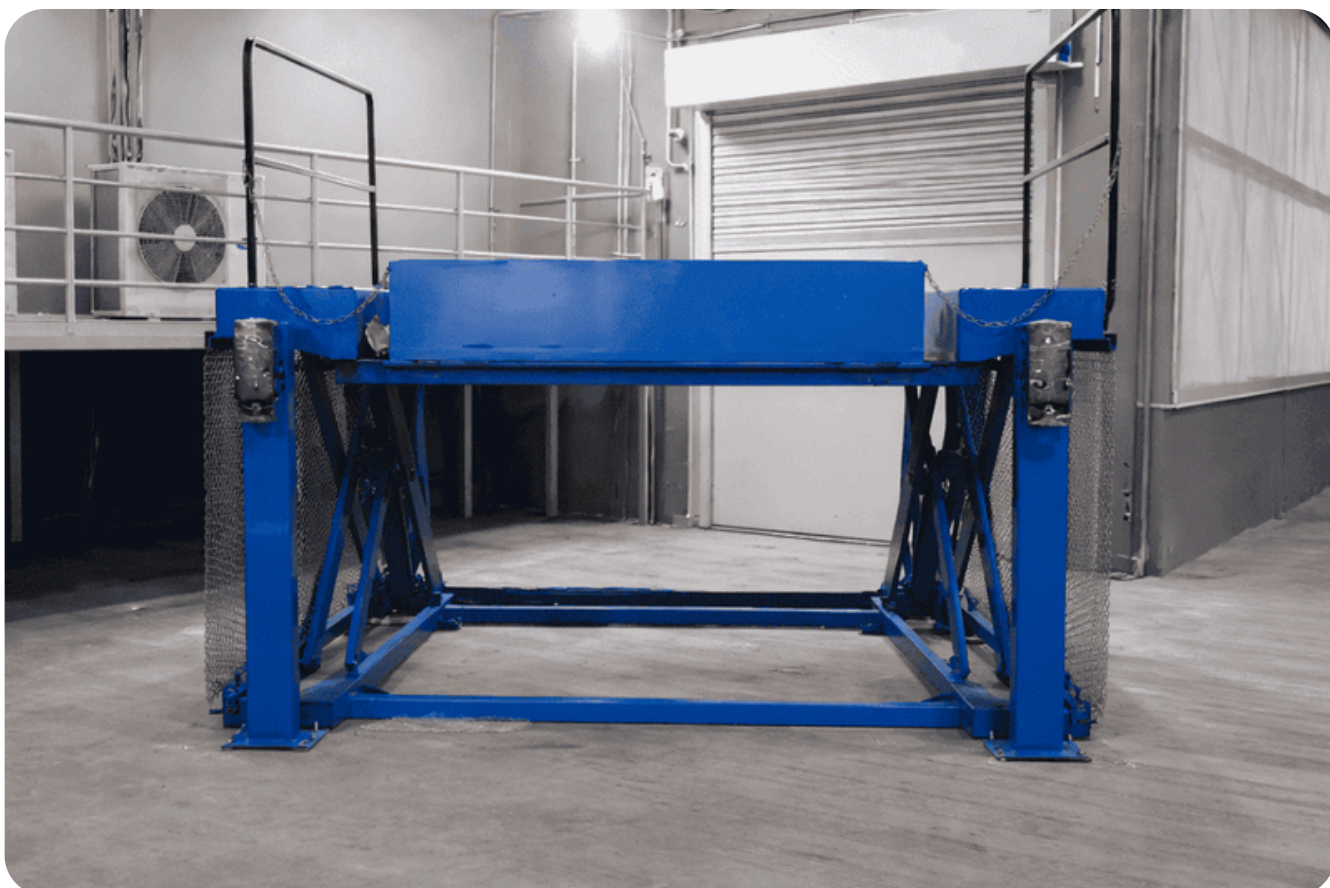
Zero Height Scissor Lift