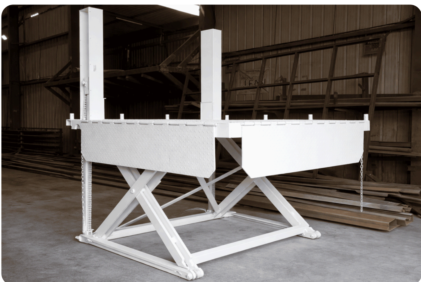
Verticle Scissor Lift