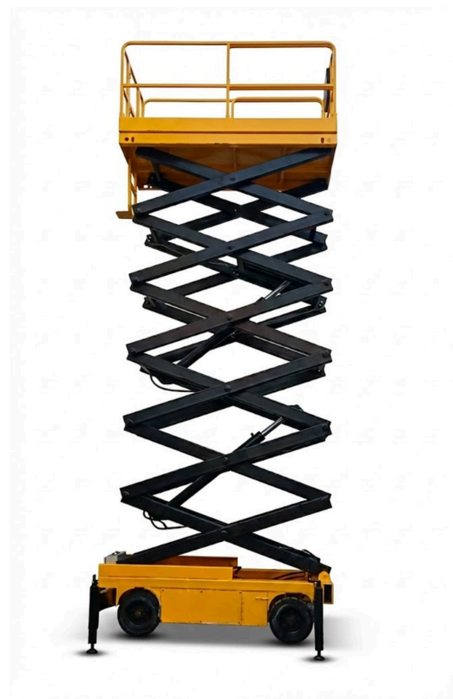
Mobile Scissor Lift