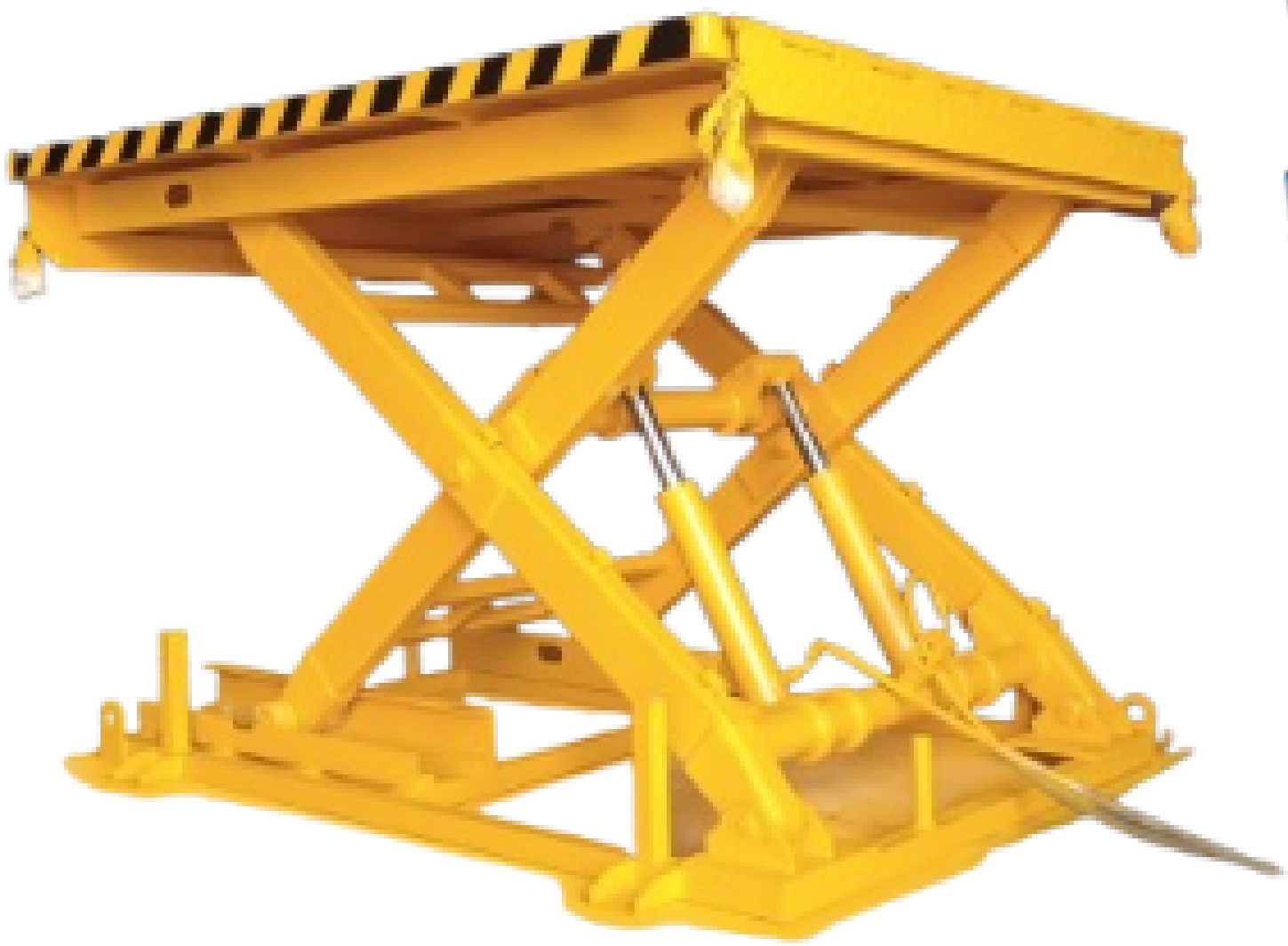
Stationary Scissor Lift