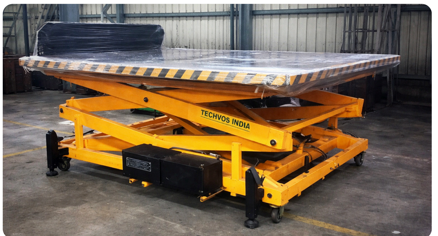
Moveable Scissor Lift