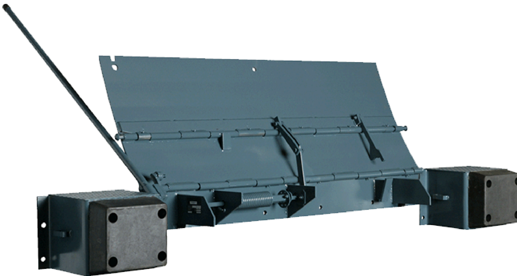
Edge of Dock Leveler