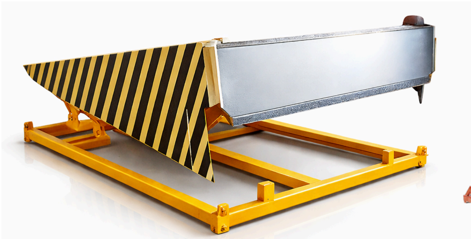
Pit Mounted Dock Leveler