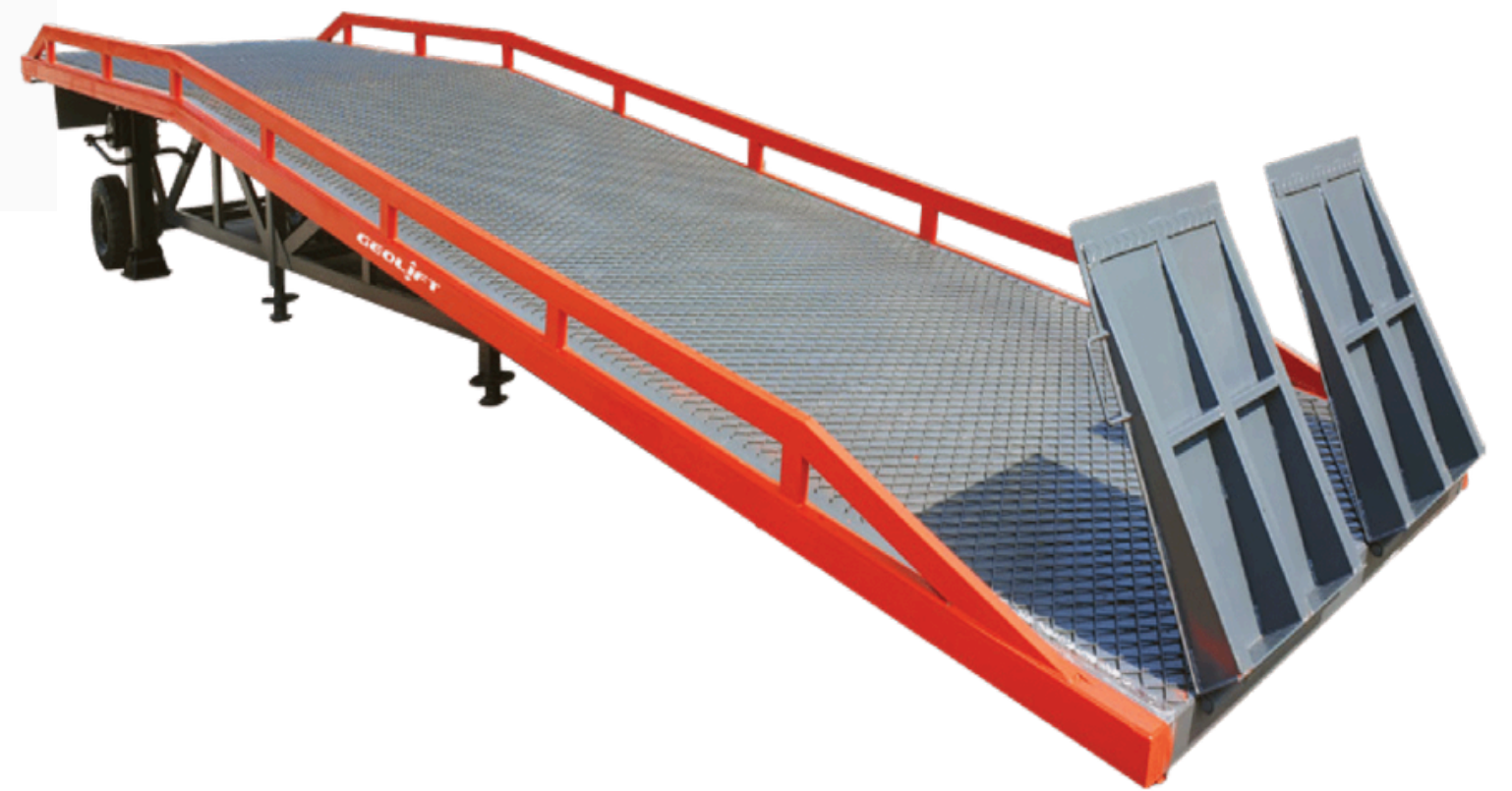
Moveable Dock Leveler