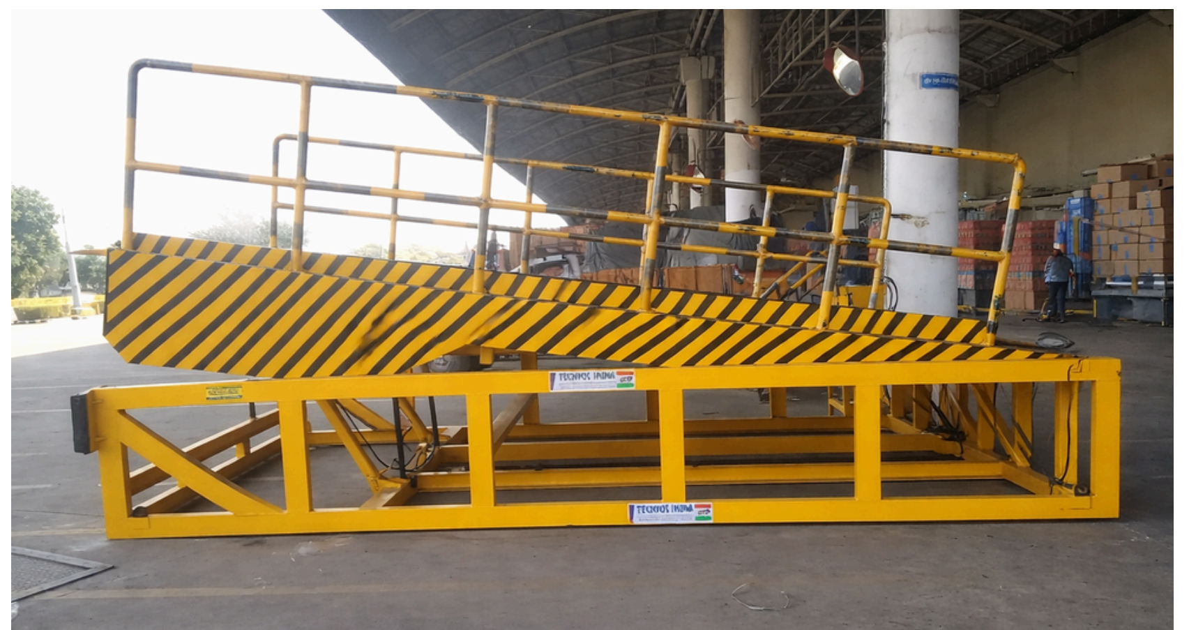
Floor Mounted Dock Leveler